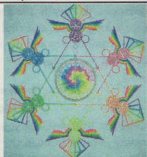
Rainbow Cathedral Sacred Art